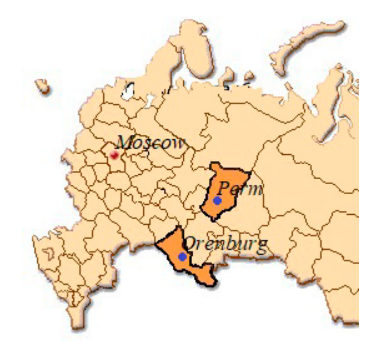
Figure 1. The position of the Perm and Orenburg territories on the map of Russia

To assess the carbon-depositing capacity of the forests of the Urals and adjacent regions, a database on the structure of the biomass of forest-forming species was compiled on the basis of published works. It includes materials from 1357 sample plotss, including for: Pinus sylvestris L. - 326, Picea obovata Ldb. - 71, Abies sibirica Ldb. - 52, Larix Sukaczewii N.Dyl. - 176, Pinus sibirica Du Tour. - 73, Betula alba L. - 172, Populus tremula L. - 81, Alnus incana (L.)Moench and Alnus glutinosa (L.) Gaern. - 64, Tilia cordata Mill. - 215 and Quercus robur L. - 127.