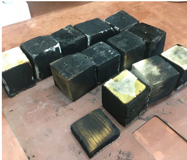
Fig. 3. Samples after incineration

After cooling the sample, the remainder of the sample was removed from the ceramic box (Fig. 3).