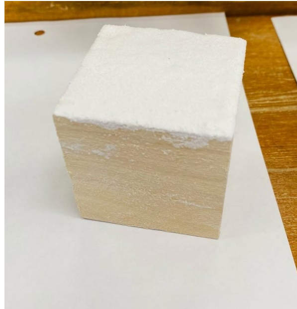
Fig. 1. A sample coated with a fire retardant

The total fire-retardant composition flow rate applied to the wood sample was determined by summing the flow rates after each layer was applied over the surface area of the sample (Table 1).