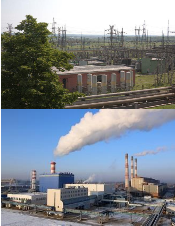
Fig. 2. Serovskaya state regional electric power plant [3].

equipment of the coal part of Serovskaya SREPP, built in the 1950s. In January 2018, the depreciated plant capacity was completely gone out of service. In 2018, as a result of modernization, the installed capacity of the power unit increased to 451 MW. Main and backup fuel unit of steam and gas installation (SGI-420) is natural gas. Gas consumption at the prospective part of the SREPP was: in 2015 - 574223 tons of equivalent fuel per year (505,987 million cubic nanometers per year); in 2016-2018 – 610280 tons of equivalent fuel per year (537,759 million cubic nanometers per year) [2-3].