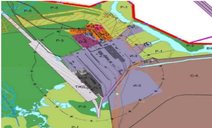
Fig. 3. Serovskaya state regional electric power plant (purple colour, marked И-3) with SPZ borders (dotted line), where dark gray is a zone of hazard class II, marked II-1.

The boundaries of the estimated (preliminary) SPZ of an industrial enterprise are established in stages: